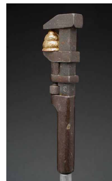
Frank McEntire, The Monkey Wrench , cast bronze/fiberglass, 2012

Day Christensen, Trees (Elm), cast bronze, 2011: located on the street island at 1300 South 1500 East. The three other remaining benches are located at Uintah Elementary School's main entrance (1571 East 1300 South), in front of Eggs in the City (1675 East 1300 South), and across the street in front of Jolley Corner Pharmacy (1676 East 1300 South).