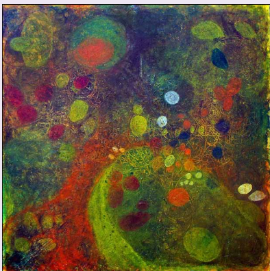
Roldan Din, Hidden Place , mixed media, 2007

Din's first paintings, produced in Seattle from 2006-2007, were on large wood boards and canvases. "I did most of my work in a drunken period of prosperity and longing. I encountered many personal setbacks and thus escaped through these paintings, producing images of struggles, of hope and of faith.